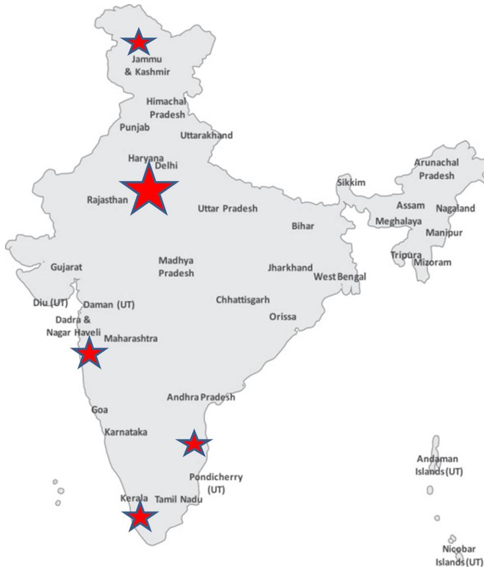
Figure 3. Geographical distribution of the cohorts from the selected studies. The size of the stars are proportional to the size of the study cohort.

All 13 FEOTN publications reported data on BRCA1 and/or BRCA2 and only three studies tested for other susceptibility genes such as TP53, RAD50, RAD52, ATM, and