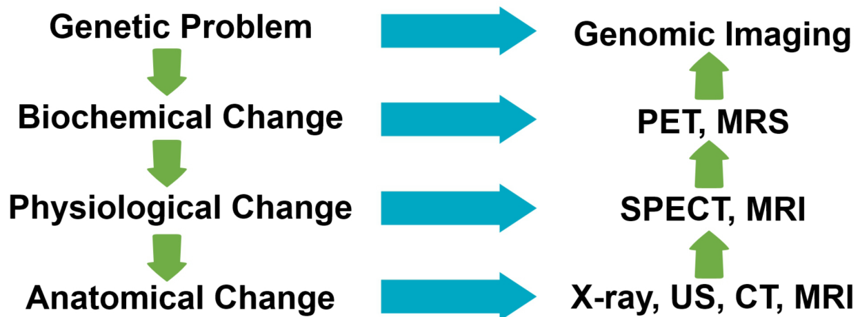
Fig. 1 Molecular imaging technology for biological phenomena