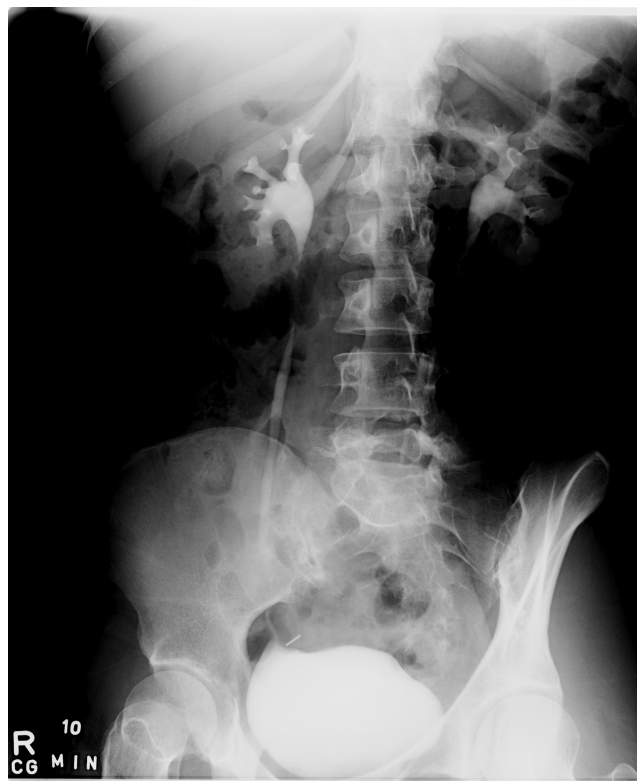
Figure 3. Postoperative intravenous pyelogram demonstrating no obstruction following right laparoscopic ureteral reimplant. [abs]

The mean age of the patients was 56 years (range, 35 to 79). Right ureteroneocystostomy was performed in 5 patients and on the left side in one. Procedures in all but one patient were performed completely laparoscopically. One patient had an elective open conversion to complete the ureteral anastomosis when the case was started emergently late in the day. No major intraoperative or postoperative complications occurred. The mean operating room time was 277 minutes (range, 180 to 360). The mean estimated blood loss was 150 mL (range, 50 to 250). The average hospital stay was 2.7 days (range, 2 to 5). Jackson Pratt drains were removed before discharge, and Foley