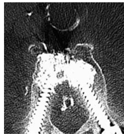
Figure 2. Axial computed tomography scan with bone settings at the level of the cement migration (L4) after pedicle screw augmentation showing bone cement in left laterovertbral lumbar veins, and inferior vena cava, as well as intraspinal (arrows).

The bone cement can be inserted into the vertebra before inserting the screw, or after that via perforated screws and it can be injected either to the distal tip of the screw hole or along its entire length. Especially in revision cases, the authors of recent publications suggest that the cement injection along the entire screw length produce higher pullout strength than the injection only at the distal tip of the screw. 13,14 However, the cement injection along the pedicle length is indicated only for intact pedicles, because of possible cement leak