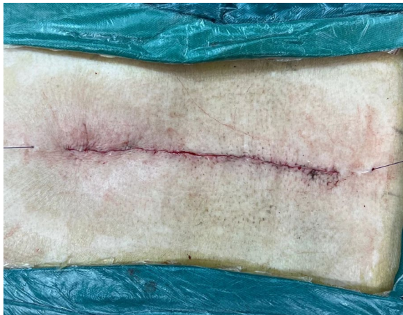
Fig. 4 Image of continuing the suture beyond the end of the incision and exiting out