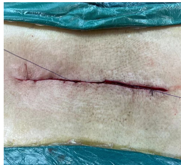
Fig. 3 Image of subcuticular layer closure from the midpoint to both ends of the incision