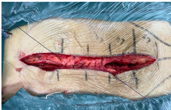
Fig. 1 Image of fascia and dermal layer closure from the midpoint to both ends of the incision

For the study group, suturing was performed with Fenkuill, a type of absorbable bidirectional barbed suture made by Hainan Jianke Pharmaceutical Co., LTD. The fascia was sutured with no interruptions with a size 2 Fenkuill; the dermal layer was sutured with size 2 or size 1 Fenkuill, and the subcuticular layer with a size 2-0 Fenkuill. For both fascia and dermal layers, the suture started from the middle of the incision and the suturing was conducted by two surgeons from the middle point to both ends of the incision at the same time, leaving 0.5–1 cm between every two suture throws (Fig. 1). When the end of the incision is reached, a backward suturing running from both end sides to midpoint of the wound was performed with one to two throws to further strengthen the suture. The rest of the suture was then cut at its exit point (Fig. 2). For the subcuticular layer, the suturing also began from the midpoint to both sides in a similar fashion, except that when reaching the end of the wound, the suturing continued beyond a bit and exited out at around 2 cm away and the extra suture was removed (Figs. 3 and 4). No surgical knots were placed in any of the barbed suture and the tension of soft tissue on both sides of the incision was kept balanced during the suturing process.