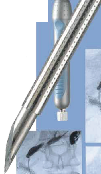
FIGURE 2: Echotip “ACCESS NEEDLE” Cook company.

A standard endosonography fine needle aspiration (FNA) needle is well visualized sonographically and can be used for pseudocyst puncture. The drawback of this needle is the small caliber (22 or 23 G) that will accept only a 0.018-inch guidewire. Using a 19 G FNA needle (Wilson-Cook Corporation), a 0.0035-inch guidewire can be inserted through the needle into the dilated bile duct. Wilson Cook Corporation has recently developed a “new access needle”; However, one of the main problems during these new techniques of hepaticogastrostomy, is the difficulty manipulating the wire guide through the 19-gauge EUS needle. The main trouble was the “stripping” of the coating of the wire, which in turn created a risk of leaving a part of the wire coating in the patient and also the impossibility to