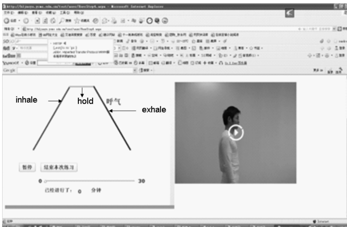
Figure 3 The third stage.

USA). The results are expressed as the mean \pm standard deviation. The number of participants, gender, and smoking history were compared between the two groups using Chi-square and Fisher's Exact tests, and other baseline characteristics were compared using the independent t -test. The impact of treatment on pulmonary function, six-minute walking distance test, and SGRQ was evaluated using repeated-measures analysis of variance. P < 0.05 was considered to be statistically significant, and the approach was two-sided.