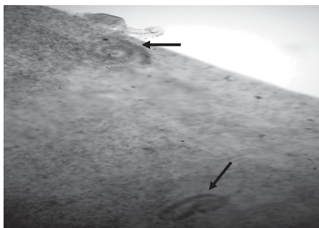
Figure 2. Nonencapsulated Trichinella spp. ( Trichinella papuae ) larvae (arrows) in the left gastrocnemius muscle of 1 case-patient, Uthai Thani Province, Thailand, 2006 (magnification \times 40 ).

was randomly selected from each of 8 pigsties and tested by ELISA for antibodies to Trichinella spp.; all pig samples were negative. A human gastrocnemius muscle biopsy specimen from a hospitalized case-patient was positive for nonencapsulated Trichinella spp. larvae (Figure 2), which provided a definitive diagnosis of trichinellosis. The parasite had a COI partial gene sequence of T. papuae (7). The case-patient had not traveled outside of Thailand. The fermented barking deer meat was negative for larvae.