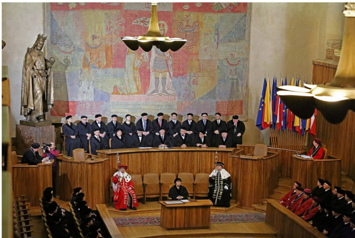
Figure 2 Charles University Aula Magna with statue of the Czech and Roman Emperor Charles the IVth