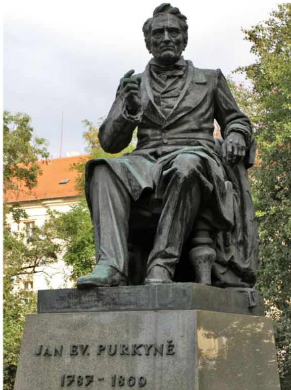
Figure 3 Statue of Purkinje in Prague (Charles Square).

(1924), discovered the influence of nicotin acid in vessel diseases and founded dietetics as a discipline.