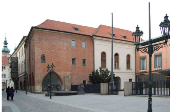
Figure 1 Carolinum - Charles University historical buildings in the center of Prague.

Jan Janský (1873-1921), a Prague psychiatrist, vainly attempted to find any distinction between sera of psychotics and normal persons in agglutination or haemolytic properties. As a side finding, however, he confirmed the discovery of three blood groups by K. Landsteiner and named them I, II, and III (the today's names are A, B, O). Moreover, he himself discovered a fourth group which he named IV (the today's AB) and he himself was aware of great importance of the discovery but his work was written solely in a Czech periodical 6 remained aside attention for