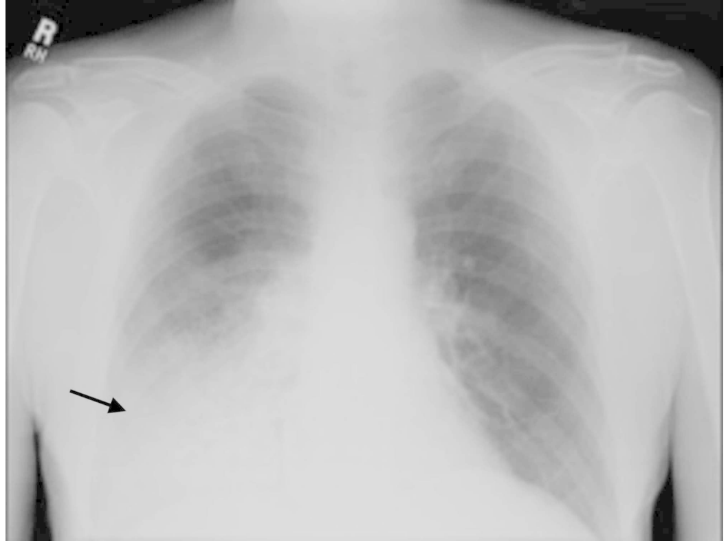
FIGURE 1: Posteroanterior radiograph of the chest shows right lower lung air-space consolidation. There is no significant enlargement of the cardiac silhouette, nor pleural effusions associated.

A 67-year-old Jehovah's Witness man with a twenty-six-year history of granulomatosis with polyangiitis (GPA) in remission was admitted to the intensive care unit (ICU) with dyspnea, hemoptysis, acute renal failure, and a hemoglobin level of 5.0 g/dL. He had been treated for ten years with high doses of prednisone and cyclophosphamide until the acute episode. Chest radiograph (Figure 1) and computed tomography (CT) of the chest (Figures 2A-2D) showed complete opacification of the right lower lobe.