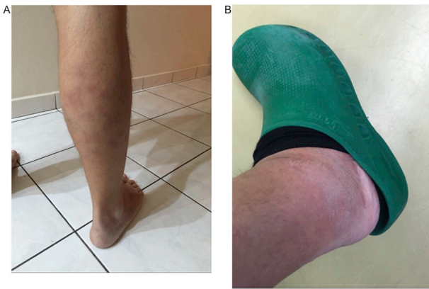
Fig. 1. External photograph of the patient's right calf reveals (A) multiple non-ulcerated erythematous nodules consistent with erythema nodosum two months prior to presentation, and (B) significant ankle edema two weeks prior to presentation.

rheumatologic work-up that included testing for anti-nuclear antibodies, rheumatoid factor, anti-dsDNA, anti-Smith, anti-Scl-70, anti-centromere, anti-SSA/Ro, anti-SSB/La, anti-Jo-1, anti-U1-RNP and anti-phospholipid antibodies. ACE and lysozyme levels were normal and chest CT was clear.