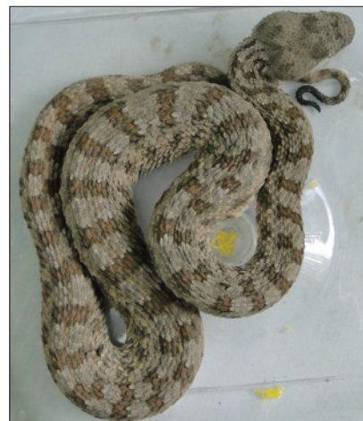
Figure 3b: Pseudocerastes fieldi