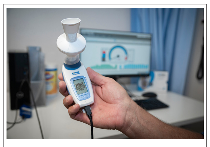
FIGURE 1 | Handheld POWERbreathe training device.

and older (MA/O) adults with OSA. However, the results for OSA adults are preliminary and require confirmation in a larger group of patients. Furthermore, guidelines issued by the American College of Cardiology and the American Heart Association (ACC/AHA) indicate that non-pharmacological therapies designed to reduce BP should be assessed for efficacy within 3–6 months of treatment initiation (28), and the efficacy of high-resistance IMST administered over the longer-term has yet to be assessed. By extension, it is not known how long IMST-induced BP reductions persist after training cessation. Lastly, in view of evidence that highresistance IMST improves endothelial function in otherwise healthy MA/O adults with above-normal BP (52), the potential for IMST to induce similar benefits in MA/O adults with OSA warrants assessment.