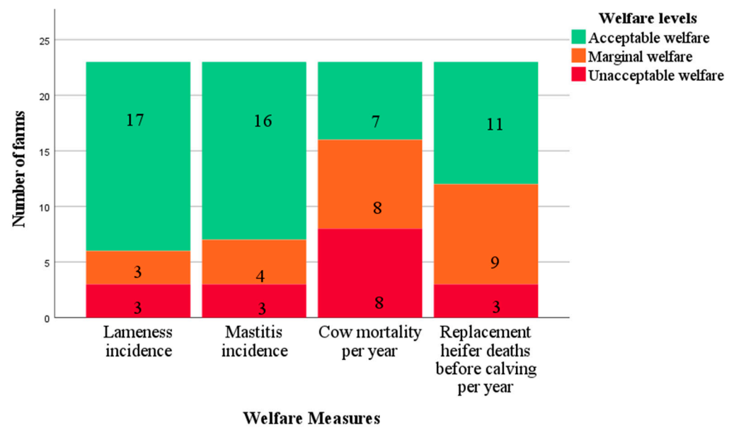
Figure 3. Stacked bar chart for welfare levels of disease and mortality data for 23 pasture-based dairy farms.