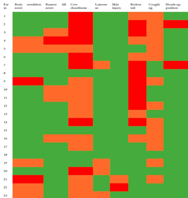
Figure 1. Heatmap representing welfare levels for eight animal-based measures from 23 dairy farms. All measures have three welfare levels (acceptable, green; marginal, orange; or unacceptable, red), except for the heads-up position which has only two levels (acceptable, green; and unacceptable, red). See Table 1 for further details of measurements and thresholds.

Descriptive statistics for the seven different animal-based parameters (with prevalence >0.5%, i.e., excluding blind eye and ingrown horn) are shown in Table 6, with a comparison to the author-derived acceptable thresholds (Figure 1). Overall mean percentage was above our acceptable range for broken tails, very dirty cows, and coughing during milking (observed percentages of 10, 17.3, and 1.2%, respectively, vs. acceptable thresholds of 5, 10, and 1%, respectively).