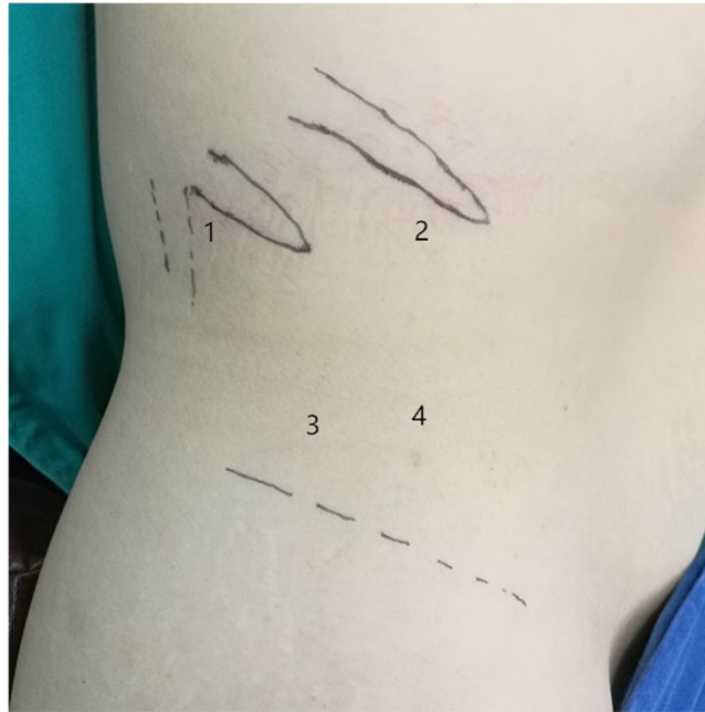
Figure 1. Port sites for single-plane retroperitoneal adrenalectomy. 1, 12-mm port below the 12th rib in the posterior axillary line. 2, 12-mm port (right side) or 5-mm port (left side) under the subcostal margin in the anterior axillary line. 3, 10-mm port above the iliac crest in the midaxillary line for the laparoscope. 4, 5-mm port placed ventral to and along a transverse line with the trocar above the iliac crest.

with a BMI of \geq 30 kg/m 2 . The results showed that for obese patients, single-plane adrenalectomy also had a significantly shorter operation time and did not increase perioperative complications compared with anatomical three-plane adrenalectomy. Moreover, the operation time of single-plane adrenalectomy was comparable between obese patients and the total patient population. This result was mostly due to the main advantage of single-plane adrenalectomy; namely, that it does not require isolation of the lateral side of the kidney and removal of excessive perirenal fat, which is time-consuming, especially in obese patients. Difficulties caused by obesity during single-plane adrenalectomy, such as a limited operative space or difficulty in adrenal identification, did not bring more technical challenges to surgeons. Additionally, adhesion within the operation field increases complications and the operative time 16 . For patients with perinephric adhesion due to diabetes or a surgical history, anatomical three-plane adrenalectomy may be more difficult and time-consuming because of excessive isolation of the lateral side and upper pole of the kidney. The superiority of single-plane adrenalectomy may be more obvious in these patients. We are doing to verify that in following study.