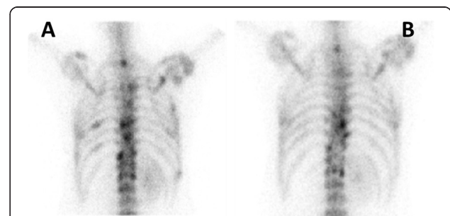
Figure 2 Sequential isotope bone scans of the patient. Isotope bone scans demonstrating response to treatment with reduction in size and number of skeletal metastases when compared to baseline (left panel, A) and 3 months after treatment (right panel, B) with temsirolimus.

Following 13 months of treatment with temsirolimus the patient developed acute onset dyspnoea on exertion. CT scan of the thorax revealed consolidation and interstitial changes of both left upper and right lower lobes of the lungs. A diagnosis of temsirolimus induced pneumonitis was made based on clinical and radiological grounds. Temsirolimus was withheld and antibiotics and steroids were given. Over a period of 2 weeks, the patient responded very well to this therapy and a chest X-ray (CXR) demonstrated significant resolution of the consolidative changes. Temsirolimus was re-commenced but within 2 weeks further dyspnoea re-emerged. The patient was treated with steroids and temsirolimus was withheld again. Following resolution of dyspnoea treatment was re-started at a reduced dose of temsirolimus (20 mg weekly). Following a