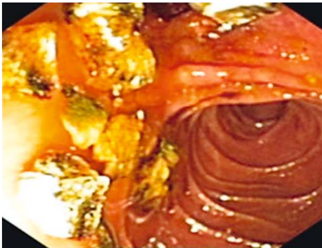
► Fig. 3 Sequential extraction of the gallstone using a Dormia basket and then a balloon catheter.

lities related to the type of endoscope used. On the other hand, GERCP offers the full range of technical capabilities of ERCP, including single-operator cholangioscopy.