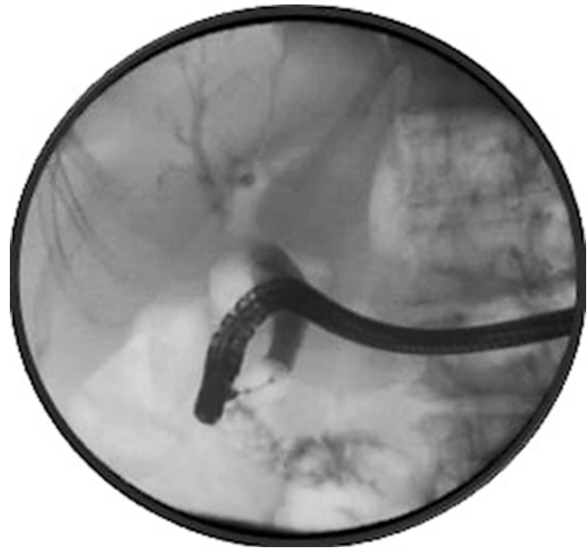
► Fig. 4 Main biliary tract and cystic stump completely empty of any stone residue. We noted the duodenoscope position from the left side through the gastrotomy.

In conclusion, combining advanced endoscopic techniques to treat a complicated gallstone disease is possible, and bariatric surgery such as Roux-en-Y bypass does not represent a contraindication anymore, even in the case of a large gallstone requiring laser lithotripsy.