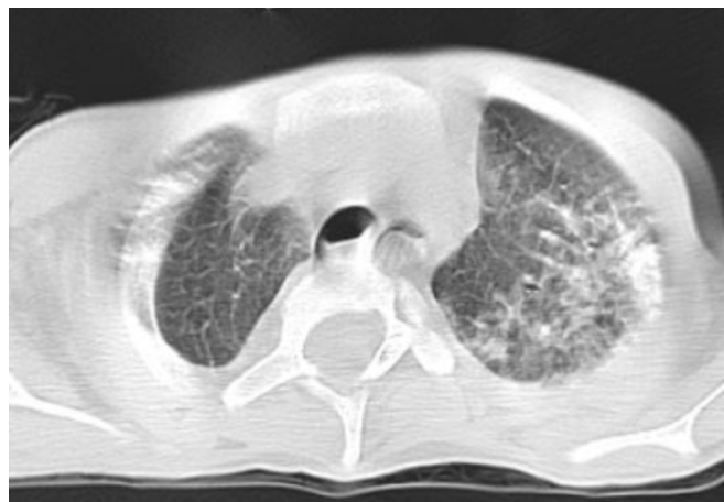
Figure 2 Chest CT of patient number 10.

suspected COVID-19. Nine were transferred from other wards with other suspected diagnoses. The median age was 7.9 years. Eight patients were men, six patients had chronic medical conditions (table 2). The other four were previously healthy.