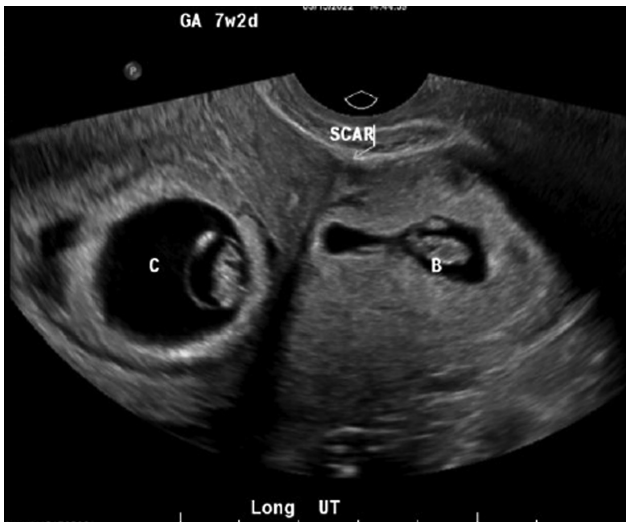
Fig. 2 Transvaginal ultrasound (TVUS) on hospital day 2, demonstrating fetus C and fetus B, with irregular gestational sac for fetus B demonstrating bulbous superior anterior component.

the very low likelihood of the pregnancy resulting in a live birth. Thus, the patient elected for termination of pregnancy. In accordance with institutional policy, the Ethics Committee met to discuss the case and approved the termination. Hematology was consulted due to the patient's history of low von Willebrand factor activity and she was found to have normal von Willebrand factor activity and antigen. It was thought that her previously low levels of von Willebrand factor activity could be due to her O blood type. Clotting factors were also checked and were normal. She was cleared for surgery by hematology.