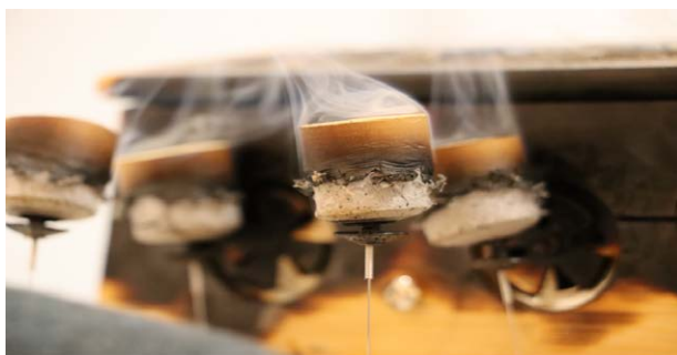
Figure 2. Diagram of warming acupuncture and moxibustion.

Acupoints include: Zhongji (RN 3), Qihai (RN 6), Shenshu (BL 23, bilateral), Shuidao (ST 28, bilateral), Panguangshu (BL 28, bilateral). Qihai is 1.5 cun inferior to the umbilicus along the anterior midline. The acupuncture needle is inserted into the body with the tip reaching a depth of 1 to 1.5 cun . One cun is defined as the width of the 1st interphalangeal joint of the patient. Zhongji is 4 cun inferior to the umbilicus along the anterior midline. The needle reaches a depth of 0.5 to 1 cun . Shuidao is 3 cun inferior to the umbilicus and 2 cun lateral to the midline. The needle tip reaches 1 to 1.5 cun . Shenshu is 1.5 cun lateral to the spine of the 2nd lumbar vertebra on the back. The acupuncture needle tip reaches a depth of 1 cun . Panguangshu is 1.5 cun lateral and inferior to the spine of the 2nd sacral vertebra on the back. The acupuncture needle tip reaches 1 cun . When patients have a feeling of “Teh Chi”, such as heaviness, numbness, and swelling, the needles will be kept in situ and burning moxa attached to the end of the needle. The moxa will be changed after burning out until 60 minutes