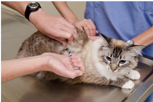
Figure 6 Cat sitting with minimal restraint for 5–10 seconds during simulated insulin administration.

potency and decrease the risk of contamination. With careful handling and refrigerated storage, it has been suggested that at least some insulin preparations can be safely used for between 3 and 6 months. 34 However, deviating from the manufacturer's recommendations should be undertaken