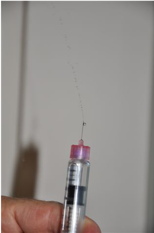
Figure 5 Air shot. One or two units of insulin are dialed and dispelled with the pen tip facing upward. This ensures that the pen is operating correctly and insulin, not air, is injected into the patient.

potency and decrease the risk of contamination. With careful handling and refrigerated storage, it has been suggested that at least some insulin preparations can be safely used for between 3 and 6 months. 34 However, deviating from the manufacturer's recommendations should be undertaken