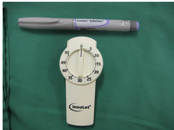
Figure 1 Innolet ® pen device with a large dose selector dial for people with impaired vision or dexterity (bottom) compared with a more standard pen (Lantus ® ) device (top).

There are six steps to proper storage and administration of insulin with a pen device: 32