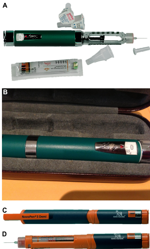
Figure 3 Examples of human pediatric reusable insulin dosing pens that can be loaded with 3 mL insulin cartridges and deliver doses in 0.5 U increments.

Notes: (A) HumaPen Luxura HD® (Eli Lilly). (B) Close up of the silver dose selector dial and release button at the end of the HumaPen Luxura HD pen. (C) NovoPen 3 Demi® (Novo Nordisk). (D) NovoPen 3 Demi with the cap removed and an insulin cartridge and needle in place.