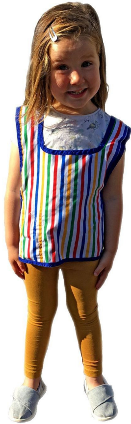
Figure 1 Custom-made tabard with inside pockets securing the two Fitbit Zips in position (contact first author for more details on tabard construction). Consent was obtained for the publication of the child's photograph.

children typically landed on one foot first and then the other to regain their balance. If a child slid their feet along the ground or the movement was so small that the coders could not identify a step-like movement, a 'no-step' was recorded.