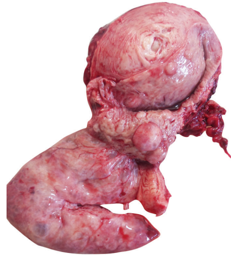
FIGURE 1: Gross photograph of a giant endometrial polyp in the lower left side of the figure, with smooth surface, cystic changes, and soft consistency. The measurement of the polypoid lesion is 10 × 9.5 × 7 centimeters in diameter.

Giant endometrial polyps are uncommon variants of classical polyps. Until today only a few cases are reported in the literature and they were associated with tamoxifen and raloxifene treatment [3–5]. Endometrial polyps represent the most common pathology associated with tamoxifen treatment in postmenopausal women with breast cancer, with a prevalence of 13–30% [5]. Tamoxifen is used in the treatment of ER (+) breast cancer. It inhibits the cancer cell growth by the competitive antagonism of estrogen at the estrogen receptor. Despite its role in breast tissue, it is an agonist of estrogen in the endometrium [9].