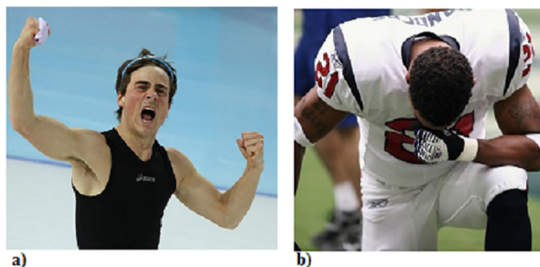
Fig 1. (a) Prototypical victory display; (b) prototypical defeat display. Pictures are licensed under CC by 4.0. Credits go respectively to M. Smelter and A. Gockowski.

A prototypical victory display is shown in Fig 1A, and prototypical defeat in Fig 1B. (As the stimuli were selected three years ago, we were unable to get permission retroactively to show them, so we substitute them. In Figs 1, 2 and 3, we use images that are very similar to those used in the experiments, with the caveat that all our experiment stimuli showed full body displays. All the images are licensed under CC by 4.0 license).