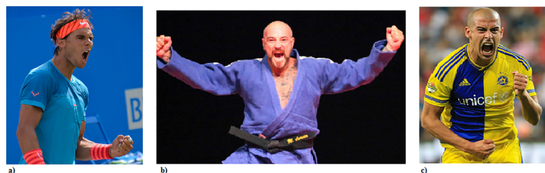
Fig 3. (a) Dominant: standing, hands clenched, head up, contracted upper and central face, mouth wide open and slightly funneled. (b) Dominant/Happy: Dominant features plus lip corners up and shoulders back. (c) Dominant/Angry: Dominant features plus lip corners down and asymmetrical body posture.

Participants were asked to rate the athletes’ emotional experience on a continuous visual analogue scale (VAS) from 0 to 100 (see Fig 2). They rated emotions that are commonly associated