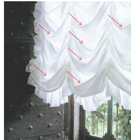
FIGURE 4: Postoperative outpouching pseudodiverticular formation.

approach we adopted, of course not standardized due to the lack of other similar cases, was the prescription of a monthly Rifaximin therapy, decision based on the clinical similarity to a typical diverticulitis of the colon. This treatment allowed the total remission of the acute episode through conservative approach, with no need of surgical revision, which would have implied both decisional and technical difficulties (resection of the involved rectal segment, performance of a coloanal anastomosis, and protective stoma). With the hope of no-recurrence for our patient, we still cannot foresee whether an eventual second inflammatory episode would be responsive to conservative treatment: if not, the only rescue treatment would contemplate the above surgical approaches. Is it worth taking the risk?