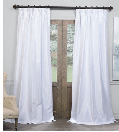
FIGURE 3: Preoperative mucosal prolapse.

This appears clearly through endoscopic examination, but MRI findings are also surprising: from an anatomic point of view, this “iatrogenic pseudodiverticulosis” of the rectum appears as a chronic stabilized condition with definitive anatomic changes. Of course, it is not possible to state that the anatomical changes revealed are due to a badly performed technique rather than the normal consequence of a well performed one. We reported a prompt clinical response to antibiotics and the avoidance of enteral feeding in this first episode of acute diverticulitis. One additional