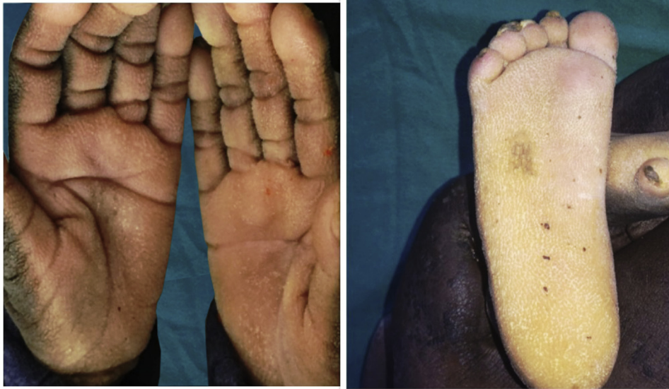
Fig 2. Stippled palmoplantar keratoderma of palms and soles.

on his entire face, neck, and upper and lower extremities; they were more thickened and spiky on back of the neck, extensor aspects of limbs, and nasal bridge with loss of hair of entire body (alopecia totalis; Fig 1).