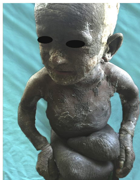
Fig 1. Hyperkeratotic warty plaques present all over the body (before treatment) with contractures of bilateral upper and lower extremities.

At the age of five, painful contractures of all four limbs developed, leading to inability to change