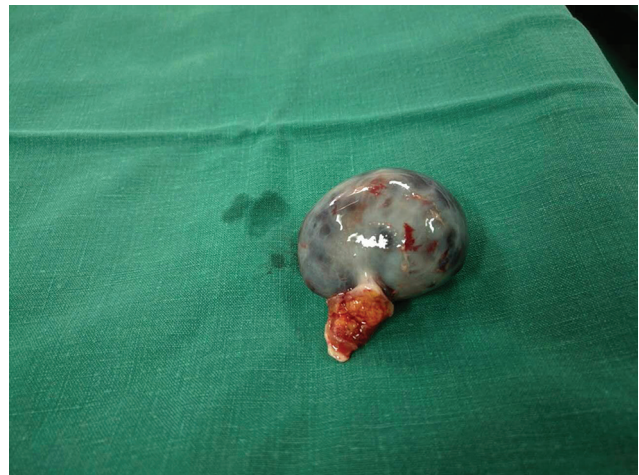
Fig. 3 Gross view of resected right atrial mass.

the tumor pedicle was removed and the tumor was completely excised ( Fig. 3 ). The inferior border of the atrial septal defect was 0.5 cm from the inferior vena cava opening and the atrial septal partial defect was sutured continuously by a Standard 3-0 PROLENE Polypropylene Suture (Ethicon, Somerville, NJ, USA). In addition, 2.5 × 1.5 cm autologous pericardial slices and a 4-0 PROLENE suture were used to continuously suture the atrial septal defect. The 5-0 PROLENE was used to repair the right atrium through continuous round-trip suture. No malformation was found in the left superior vena cava and pulmonary vein. The extracorporeal circulation lasted for 86 minutes and the aortic clamping time was 34 minutes. After stopping aortic clamping and cardiac reperfusion, the patient returned to sinus rhythm.