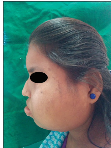
Figure 2: Profile view