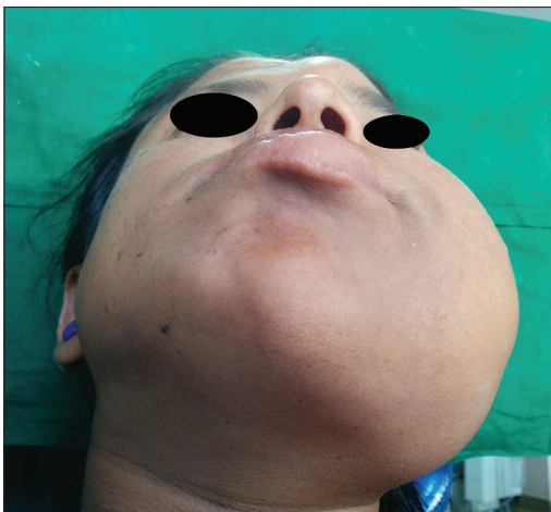
Figure 3: Waters view