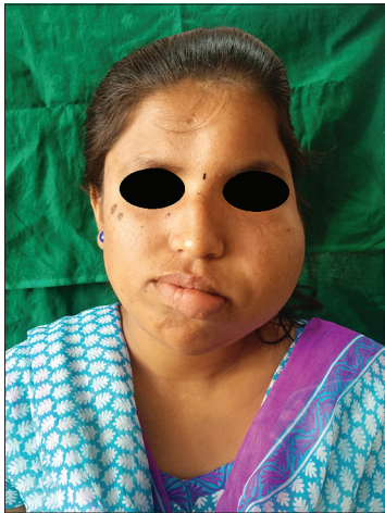
Figure 1: Frontal view

Congenital hemihypertrophy or partial gigantism was first described by Meckel in 1822 and gained widespread recognition after Gesell's classic description as "essentially a developmental deflection of the normal process of birth." [2,3]