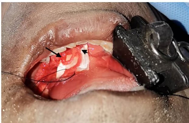
Fig. 1 Image showed left SLG has a major duct (black arrow) that joins the SMG duct (black arrowhead) prior opening at the papilla