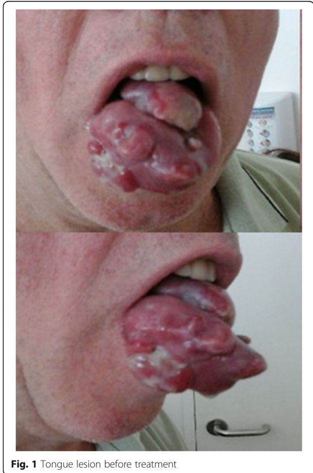
Fig. 1 Tongue lesion before treatment

RCC is one of the most common tumors to metastasize to the head and neck region, after lung and breast cancer [2, 4, 5]. A tongue metastasis as an initial presentation of RCC is extremely rare [4, 5]. An exhaustive literature review conducted by Azam et al. showed 28 reported cases of RCC tongue metastases from 1911 to 2008 [5]. Out of these, three cases presented initially with tongue metastases [3, 5]. To complete this study, we conducted an additional literature review, presented in Table 1, of 18 cases published from 2008 to 2017 [3,