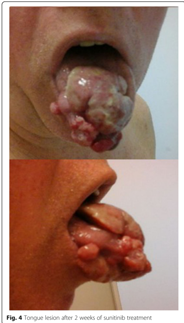
Fig. 4 Tongue lesion after 2 weeks of sunitinib treatment

4, 6, 9–23]. Only 6 of the 18 reported cases of RCC tongue metastasis presented initially with tongue metastases [3, 4, 12, 17, 18, 20].