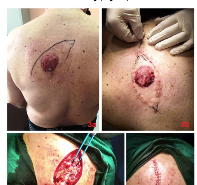
Figure 3: a) Skin lesion on the left posterior upper-trunk region; b) Preoperative excision markings, bleeding and oedema from local anaesthetic infiltration; c) Tumour is partially excised, showing substantial bleeding and performance of electrocautery hemostasis; d) Primary surgical defect is completely reconstructed, ready for antiseptic dressings

A 73-year-old male presented to the dermatology department with a large cutaneous tumour located on his posterior trunk that had been slowly growing for more than ten years. The patient denied any treatment or medical attention before the presentation. The patient's medical history revealed previous coronary bypass surgery. At the time of admission, he had been taking a daily dose of acetylsalicylic acid (ASA) as a preventative therapy, which before surgery was replaced with 0.6 ml subcutaneous nadroparin calcium twice daily. On examination, the tumour was located on the left posterior upper trunk. The skin lesion was well marginated, pinkish-grey in colour, with an eroded surface and focal bleeding (Fig. 3a).