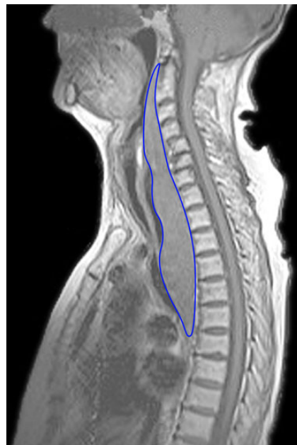
Figure 2: MRI showing the elongated retropharyngeal mass anteriorly of the spine, compressing the trachea and esophagus. The mass starts at the level of the second cervical vertebra and expands into the posterior mediastinum until the level of the seventh thoracic vertebra. Length of the hematoma is 200 mm with an anterior–posterior diameter of 33 mm. Compression of the trachea to a minimal diameter of 3 mm.

After this event, calcimimetic drug therapy was continued, and blood calcium and PTH levels remained within the normal range. Hence, autoperathyroidectomy was suspected and surgery was cancelled. After 4 months, however, calcium and PTH levels increased again. On parathyroid scintigraphy and SPECT scan, a small area at the right lower thyroid lobe showed increased activity, again suspicious for a parathyroid adenoma. Since the patient experienced symptoms of hypercalcemia,