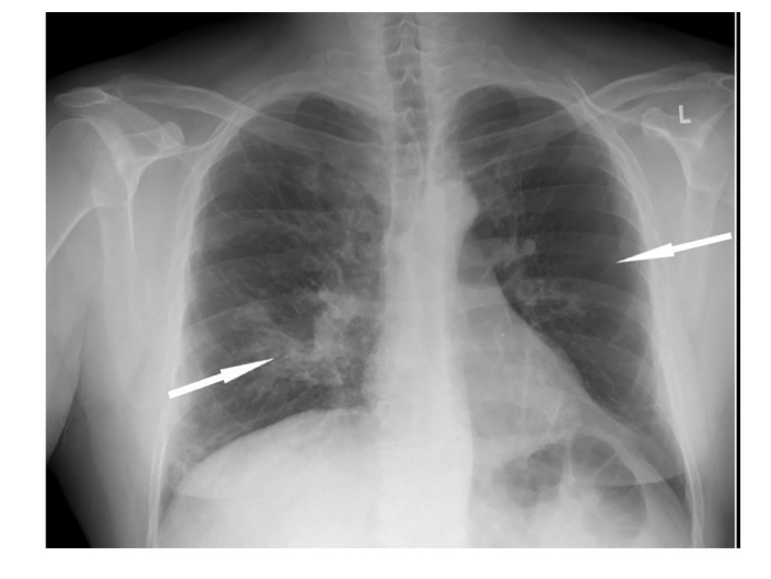
Figure 1. Chest X-ray illustrating patchy infiltrates in the right lung lower lobe (arrow) and a hyperlucent left lung (arrow).

The patient had a positive detection of severe acute respiratory syndrome 2 (SARS-CoV-2) nucleic acid in the examined nasopharyngeal sample using reverse transcriptionpolymerase chain reaction (RT-PCR). The patient was unvaccinated against SARS-CoV-2. He was hospitalized in the COVID-19 unit and was administered oxygen therapy with