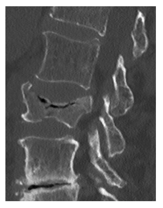
Figure 1: Preoperative CT scan with an atraumatic lumbar vertebral fracture.

Degenerative changes (i.e. of the spine) can increase the t-value. If, in these cases, bone density scans of the