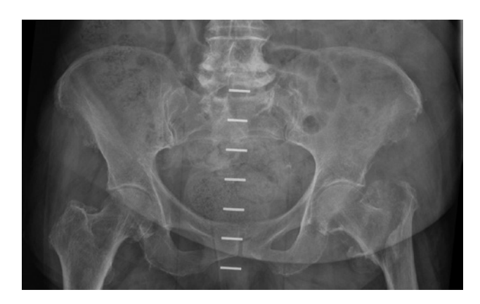
Figure 2: Preoperative X-ray with a pertrochanteric fracture of the proximal femur on the left side.

hip cannot be applied, quantitative computed tomography (CT) scans are recommended [16, 17].