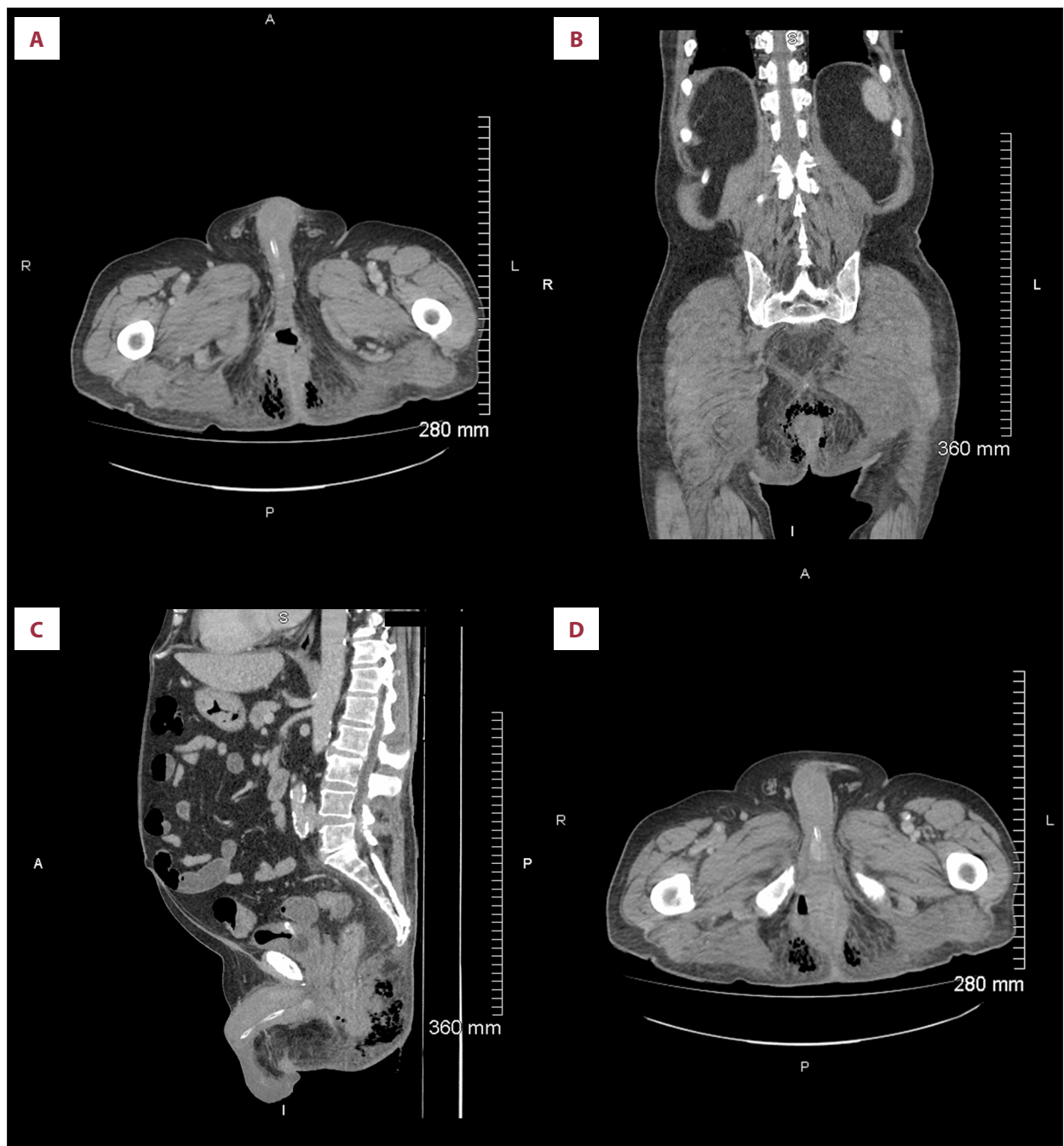
Figure 1. Computed tomography scan. (A) Standard transverse images, in the portal venous phases, demonstrates gas within the ischioanal fossa bilaterally. There is extensive soft tissue stranding. (B) Axial and coronal planes: The gas vacuoles within the soft tissue and around the anal canal consistent with gas due to gangrene. (C) Sagittal images demonstrate this associated gas and fluid-filled tract extending up to the levator musculature. The changes across the midline are in close proximity to the posterior aspect of the anal canal. (D) Lower slices of transverse images demonstrate that the changes cross the midline and are in close proximity to the posterior aspect of the anal canal, in keeping with an ischioanal abscess with horseshoe extension.