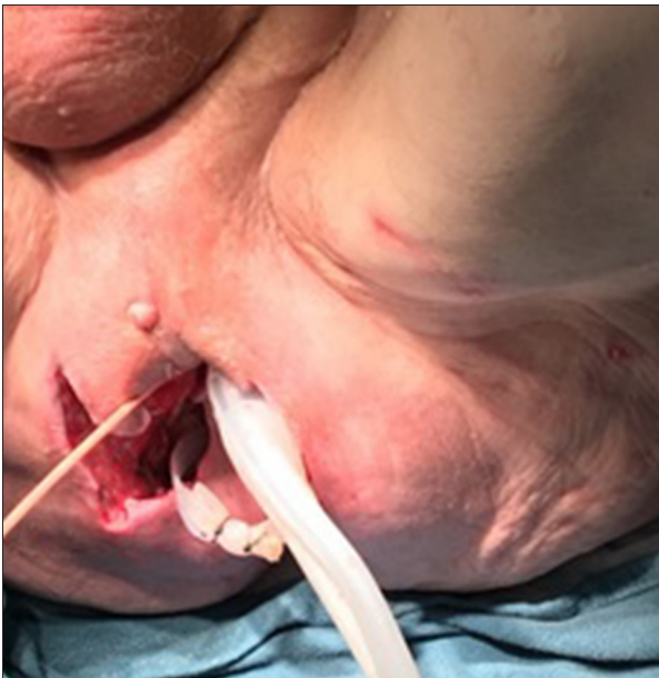
Figure 3. Picture of the patient's perianal area with a drainage tube during operation.

prior to hospital admission. No additional anti-hyperglycemic medications were needed because the patient lost a significant amount of weight and his blood glucose levels were controlled on his remaining home medications: metformin, sitagliptin, and insulin glargine.