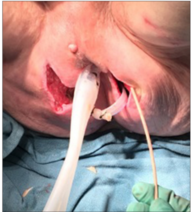
Figure 4. Picture of the patient's perianal area with a drainage tube during operation.