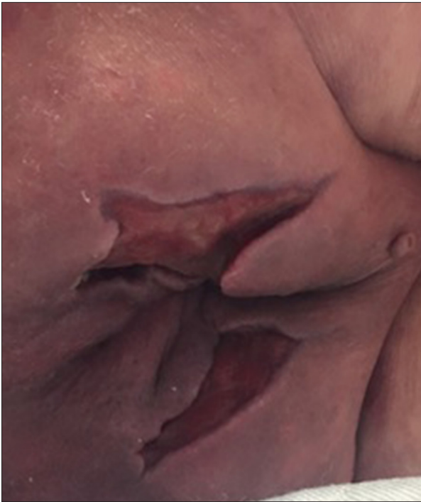
Figure 2. Picture of the patient's perianal area.