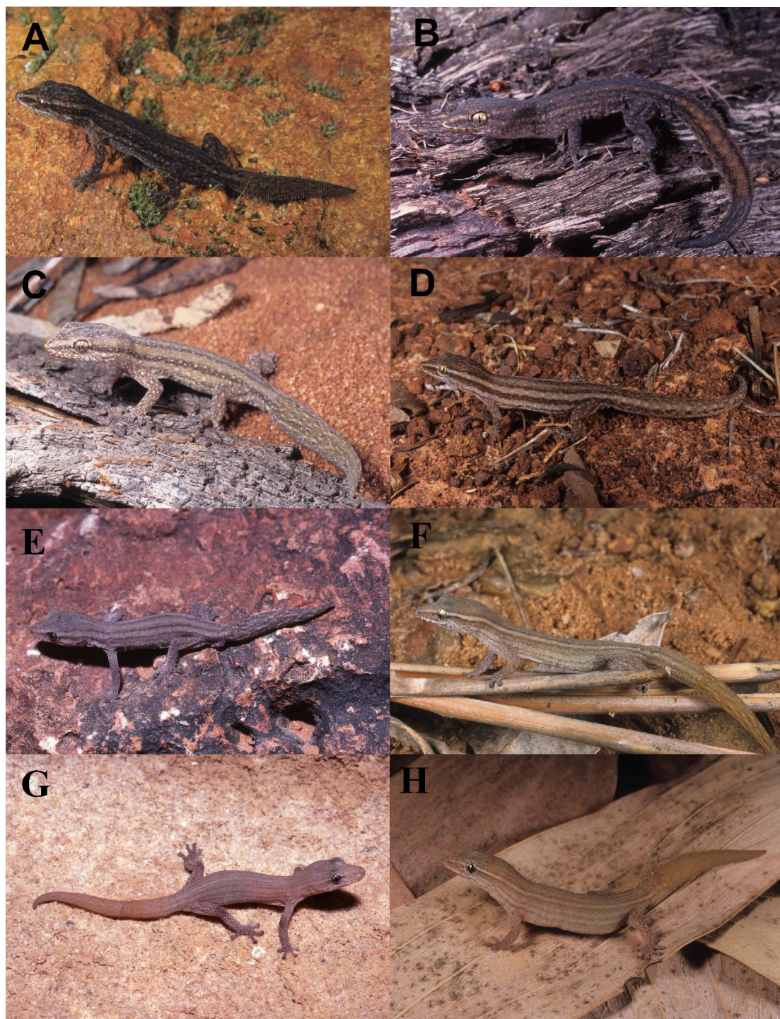
Figure 3 Candidate species of Crenadactylus . Pictures in life of 8 of the 10 candidate species currently confounded within the nominal species Crenadactylus ocellatus A) South-west B) Carnarvon C) Cape Range D) Pilbara E) Central Ranges F) Kimberley B G) Kimberley D and H) Kimberley E.