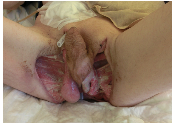
Figure 6 Debridement, suprapubic catheter change and subcutaneous testicle relocation towards the inguinal region – shown is the 30th day post-surgery.

Had the patient preferred to continue with ambulant therapy, the suprapubic catheter would have been closed off in order to induce spontaneous micturition via the urethra.