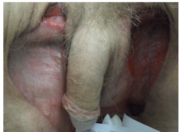
Figure 7 The situation close to patient's release: the wound shows granular tissue formation and is without any visible necrotic areas.

Due to the tegument appearance of the scrotum with black and yellow–green necrosis, which spontaneously perforated and the specific smell of moist gangrene on this immunocompromised, alcoholic patient, the diagnosis of Fournier necrotizing fasciitis was established. It was also considered that the peripheral necrosis might have appeared due to a septic embolism; even so, septic embolisms normally lead to acral necrosis, with subsequent lower extremity amputation. It is also a well-known fact that the clinical tableau for septic embolism is different from the one typical for Fournier necrotizing fasciitis; the skin is pale and marbled, and the patient is in shock and exhibits acral necrosis, without rotten odor.