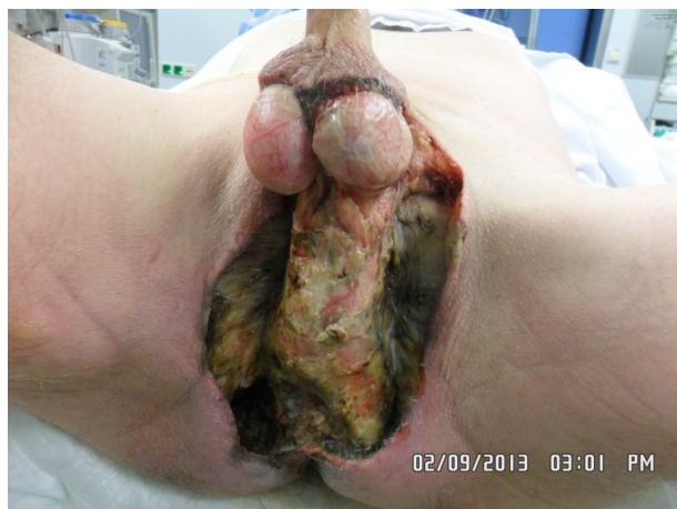
Figure 2 The perforation of the necrosis with a smell of moisture gangrene.

Due to an ileus induced by adhesion pathology, the patient had a laparotomy with adhesiolysis. From this surgical department, he again left the hospital in good mental health, was spatial and time oriented and cooperative, with