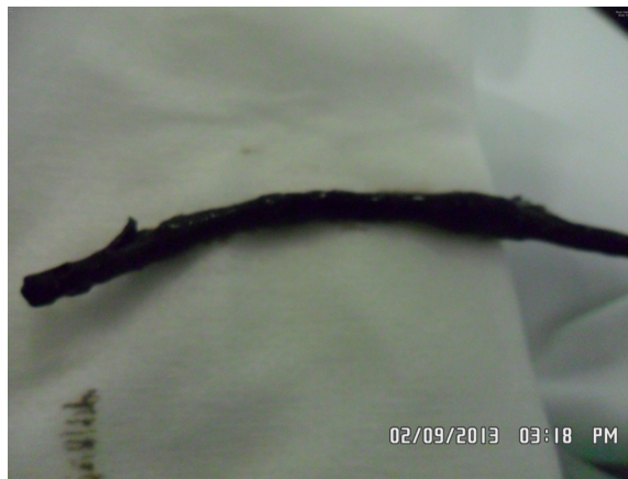
Figure 3 The dislocated stent from 2008, used to guide the pseudo-cyst's content into the stomach.