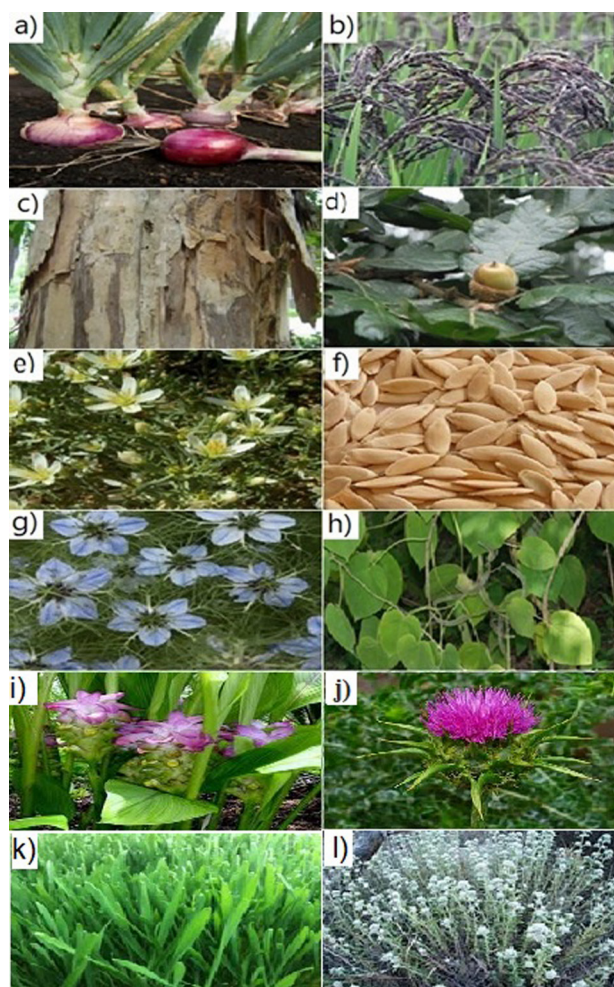
Figure 1. a) Allium ascalonicum , b) Black rice, c) Cinnamon, d) Oak, e) Peganum harmala , f) Cucumis melo seeds, g) Nigella sativa , h) Marsdenia tenacissima , i) Curcuma longa , j) Silybum marianum . k) Wheatgrass, l) Teucrium polium .

The Teucrium polium (Figure 1l) is a wild-growing flowering plant found in Europe and southwestern Asia. T. polium has been applied in Iranian traditional medicine for treating multitude of diseases due to its pharmacological properties. This plant has been reported to have hypolipidemic 62 hypoglycaemic 63 anti-nociceptive 64 anti-oxidant, anti-bacterial, anti-fungal, anti-septic, and anti-inflammatory 65 potentials. There has also been an anti-angiogenic feature of T. polium extract reported which is attributed to a decreased NO secretion by HUVECs. Aside from blocking NO secretion and proliferation inhibition, T. polium can also trigger apoptosis by increasing Bax (a pro-apoptotic factor) expression and decreasing Bcl-2 expression (an anti-apoptotic factor). 63 In 2019, Askari et al reported that the T. polium extract inhibited HUVEC cell growth in vitro and also VEGF secretion. These results show that T. polium could be a candidate for angiogenesis prevention. 66