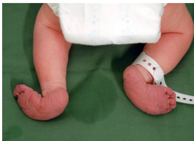
Figure 2 Malformed "rocker bottom" feet.

Eye examination did not show any sign of retinal disease or hypoplasia of nervus opticus. She had a slight ptosis