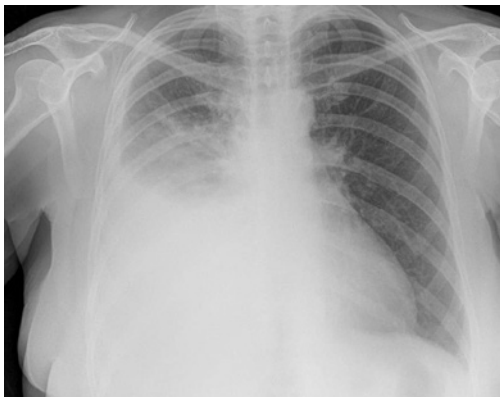
Figure 1 Initial chest radiography.

A 60-year-old civil servant presented to the respiratory department with a 4-week history of dry cough, dyspnoea, rigours and malaise. She was a nonsmoker with a past medical history of well-controlled asthma, diagnosed 30 years previously. She had no pets. Medication consisted of a salbutamol inhaler only. On examination, chest sounds were vesicular and a general inspection was normal. She had no rashes, evidence of arthropathy or focal neurology. Routine blood tests revealed an eosinophilia of 9 \times 10^9 eosinophils per L and a C-reactive protein concentration of 106 \text{ mg} \cdot \text{L}^{-1} . Chest radiography and cross-sectional computed tomography (CT) imaging demonstrated consolidation of the right lower lobe with a moderate-sized pleural effusion (figures 1–3).