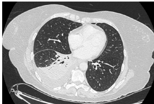
Figure 2 CT of the thorax demonstrating right-sided basal consolidation and effusion.