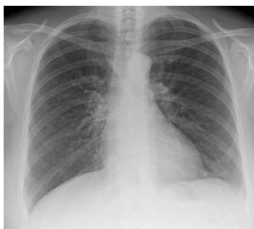
Figure 5 Chest radiography demonstrating resolution of airspace shadowing following 10 days of prednisolone.

are very rare. It is a clinical diagnosis based on the presence of respiratory symptoms for >2 weeks, pulmonary infiltrates, BAL and/or peripheral blood eosinophilia, and exclusion of other causes of eosinophilic lung disease [2, 4].