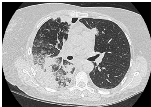
Figure 3 CT of the thorax demonstrating right-sided multifocal consolidation and effusion.

Cite as: Sobala R, Conroy K, Tedd H, et al. Eosinophils and effusion: a clinical conundrum. Breathe 2017; 13: e109–e113.