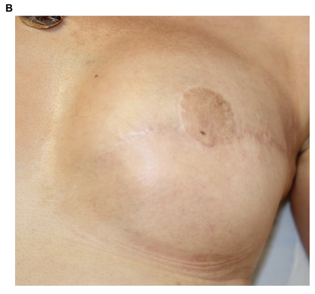
Figure 2 Example of results obtained after two sessions of vascular laser and two sessions of fractional non-ablative laser.

Note: (A) Before treatment; (B) after treatment.