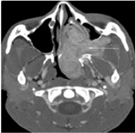
Fig. 2 Computed tomography scan showing a Fisch stage 3 JNA

The anaesthetist and surgeon based decisions to transfuse each patient on their haemoglobin and clinical stability. The transfusion trigger was a haemoglobin of 7.0 g/dL or a falling pH level or an increasing anion gap. Blood was collected from the cell saver unit by a technician. Heparin was added to the collected blood, and only processed if a sufficient volume was recovered, or if the patient required a blood transfusion based on the above parameters. The disposables and the leukocyte filter need only be set up when a decision to process the blood is made. We found that using this standby technique could reduce the costs of cell salvage by 90 % if no blood was processed. This is important in resource-restricted hospitals.