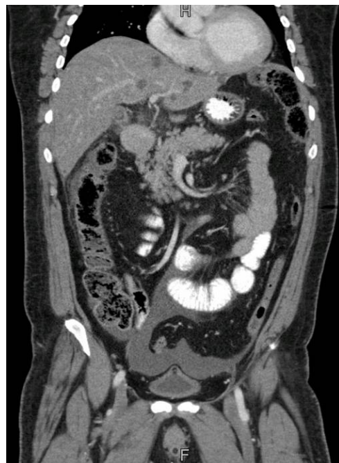
Figure 2 Sagittal section of abdominal CT scan showing pericholecystic fat stranding, and mild fluid in the pelvis.

Our case is unusual because our patient was younger in comparison, had no prior history suggestive of gallbladder disease and had no known medical co-morbidity. Histopathological examination of the specimen showed features of acute-on-chronic cholecystitis leading to the derivation that the prior episodes of cholecystitis in this patient were clinically silent. Per-operatively our patient's gallbladder showed dense adhesions with the surrounding structures and no signs of gangrene of the rest of the gallbladder. This further strengthens the possibility of clinically covert episodes of acute cholecystitis in the past due to the adhesions noted; however the patient denied any past history of abdominal pain. The gallbladder perforation in our case presumably occurred within the first 12-18 hours of the onset of symptoms. In addition, the perforation occurred at the neck of the gallbladder which is an uncommonly reported site for such an event. The most common sites for the perforation of the gallbladder are the fundus and the body of the gallbladder due to