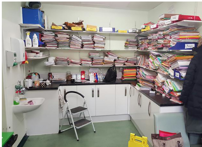
Figure 1 Pending discharge summaries at the start of the project.