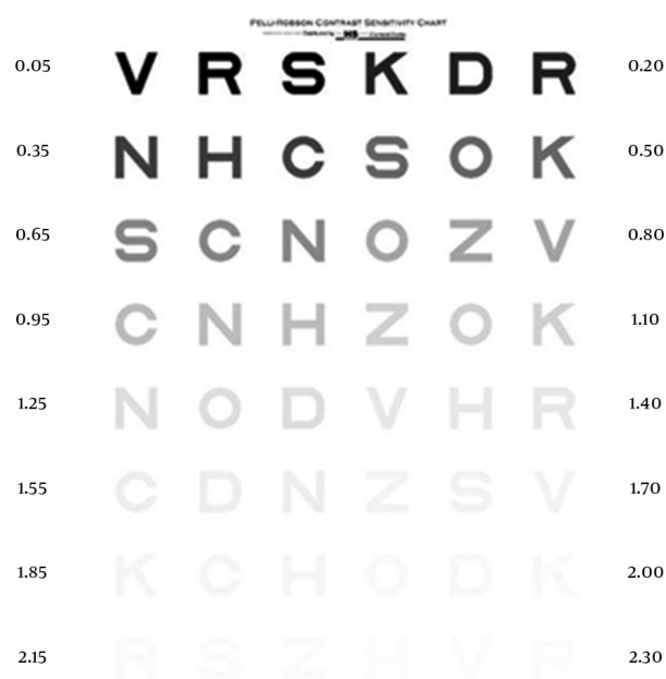
Figure 1. Pelli-Robson Contrast Sensitivity Chart

The numbers give the log CS corresponding to the neighboring group of three letters. For example, the number 2.00 appears next to a group of letters with a contrast of 1/100 (i.e. 1%) indicating a log CS of 2.00.