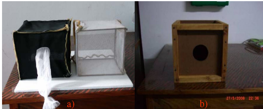
Figure 1 A photograph of a) black cloth and netting cages, b) cage made with mud-lined panels.

The fungal solution was applied to the delivery surfaces using a hand-held air compressor sprayer (Minijet®, SATA, Germany) held 50 cm away and at a right angle to the surface. About 23 ml of fungal formulation ( 2 \times 10^{10} conidia m^{-2} ) was applied onto each of the surfaces. Treated materials were left to dry for 48 h. Sections of netting and black cotton cloth were then joined using Velcro strips, to fit over 20 \text{ cm}^3 wire frame cages. Mud-lined plywood panels were assembled into 20 \times 20 \times 20 cm cages. Mosquitoes were then exposed to the treated surfaces (Figure 1) as described in the bioassay procedures below.