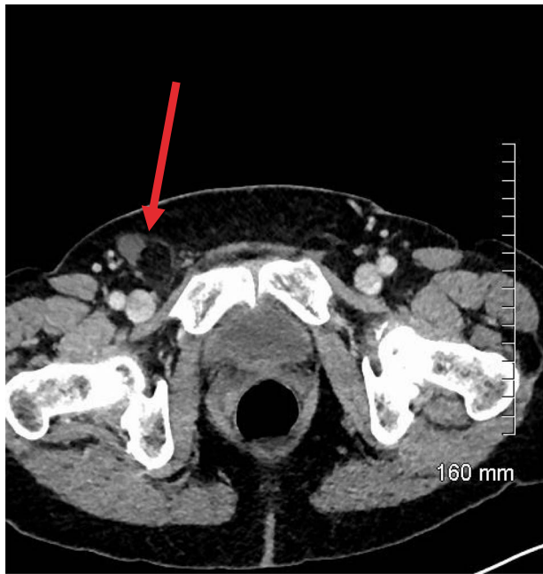
Figure 1: Axial contrast-enhanced CT showing hernial sac containing fat and simple fluid but no appendix (red arrow).