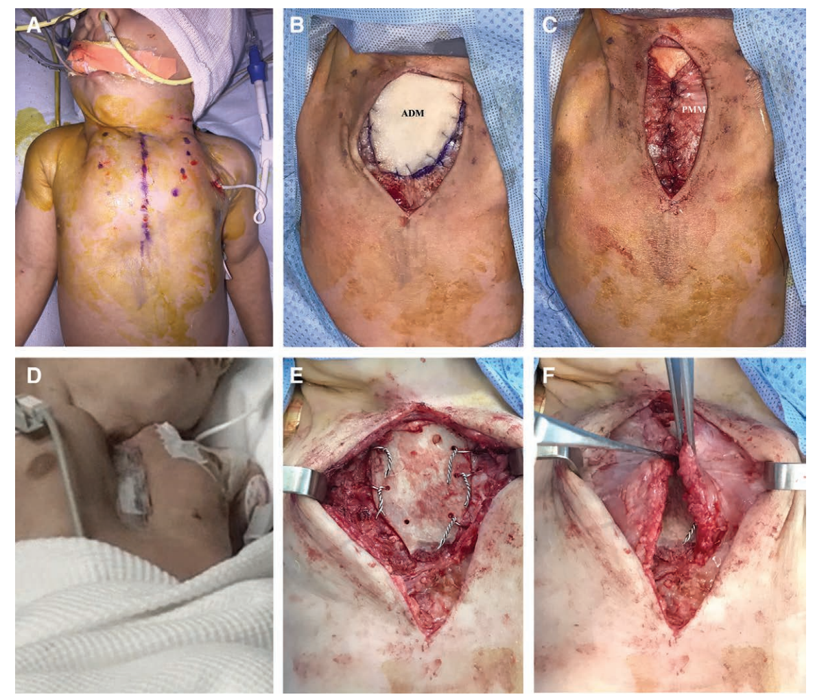
Fig. 4. Operative planning and reconstruction. A vertical incision line was made, followed by raising cutaneous and bilateral pectoralis major muscle flaps (A). SurgiMend dermal matrix graft was cut and secured to the cleft margins followed by approximation of bilateral pectoralis major muscle flaps (B and C). Postoperative complication of inward chest retraction is shown (D). Definitive skeletal reconstruction with allogeneic bone graft followed by bilateral pectoralis major advancement flaps (E and F). PMM, pectoralis major muscle; BG, bone graft.

Early surgical reconstruction of sternal cleft was recommended preferably in the neonatal period in which chest wall elasticity allows for primary approximation.<sup>9-11</sup> More complex interventions were recommended if such elasticity is lost or the characteristics of the cleft preclude primary cleft simple approximation like clavicle dislocation, chondrotomies, or the use of various autologous graft