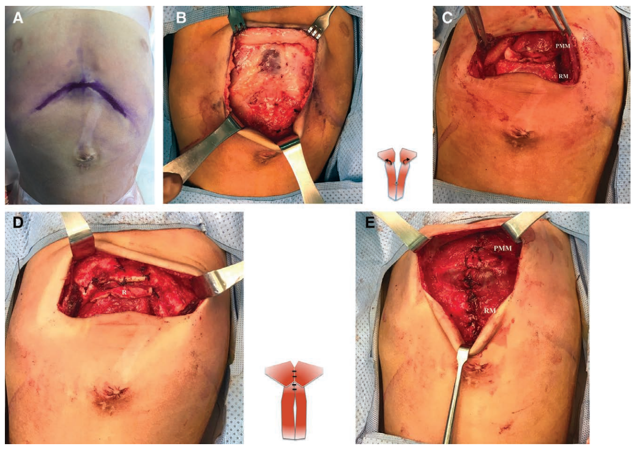
Fig. 2. Operative planning and reconstruction. Horizontal incision line followed by raising cutaneous flaps (A and B), followed by raising bilateral pectoralis major and rectus abdominis muscles as single units bilaterally (C); rib graft was then harvested and secured to the cleft margins after being cut into several segments (D). The muscles were then advanced and mobilized to the midline to cover the rib grafts (E). PMM, pectoralis major muscle; RM, rectus abdominis muscle; R, rib.

take and HOX b gene anomalies.<sup>7</sup> The disease in general has female predominance.<sup>12</sup> When a patient is identified as having a sternal cleft, meticulous screening and patient assessment are warranted to rule out any associated anomalies