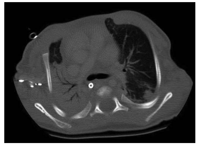
Fig. 3. Axial section of preoperative CT scan. Shows partial superior sternal cleft with distance between the manubrium sides of 4 cm together with partial herniation of the left lung and upper mediastinal structures through the sternal cleft.

and supraumbilical raphe (PHACES) syndrome,<sup>15</sup> Cardiac anomalies including Cantrell's pentalogy, among others.<sup>16</sup> Sternal clefts can also be an isolated entity, in which patients are usually asymptomatic, except when crying or coughing, which causes paradoxical chest wall movement (bulge during expiration and depression during inspiration).<sup>2,12</sup> Without surgical intervention, patients are at high risk of impaired oxygenation, frequent dyspnea and cough, as well as multiple chest infections.<sup>3</sup> This was evident in 1 of our patients, in whom paradoxical motion of the chest wall was associated with difficult weaning from ventilator support till further intervention to support the chest wall was applied.