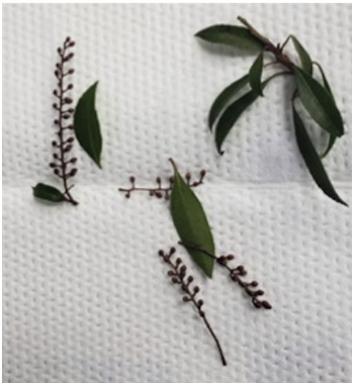
FIGURE 2 Discovered Plant Material

Upon further assessment of the patient's belongings with the patient's consent, a plastic bag was discovered that contained the plant. After consultation with the hospital's on-site toxicologist, it was determined that these plant materials likely were a Pieris species, better known as lily of the valley bush, which has previously been known to contain grayanotoxins.