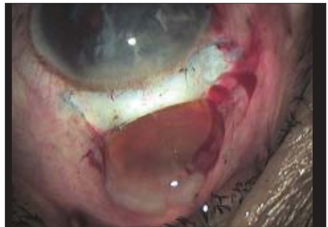
Figure 4: The Fishhook extracting the nucleus