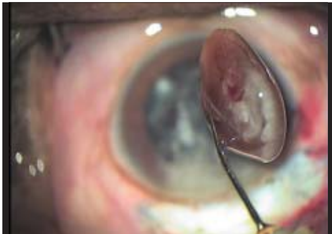
Figure 5: Extracted nucleus, side view

extracapsular to tunnel surgery, it requires about 20-30 assisted surgeries till they master the nucleus hook extraction through the tunnel. An evaluation of 26 fellows and ophthalmologists on surgical training shows that with a supervised stepwise approach the surgical complication rate is very low with