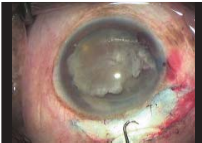
Figure 3: Fishhook before insertion