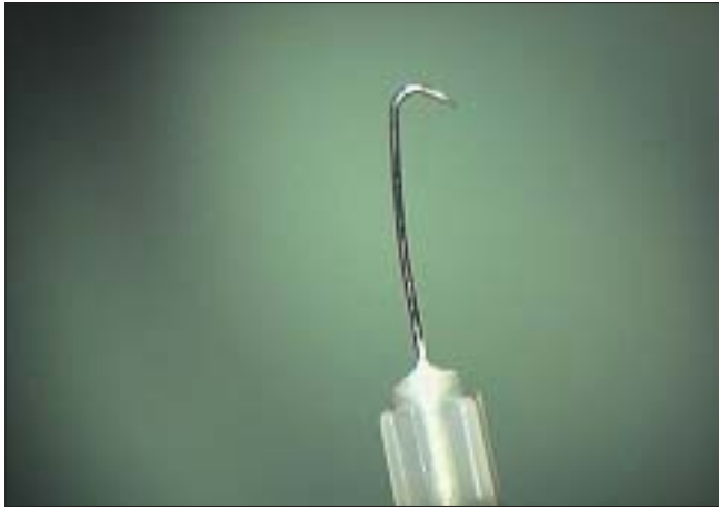
Figure 1: "Fishhook" made from a 30-G needle